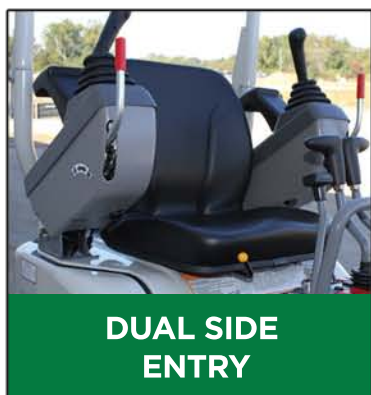
DUAL SIDE ENTRY