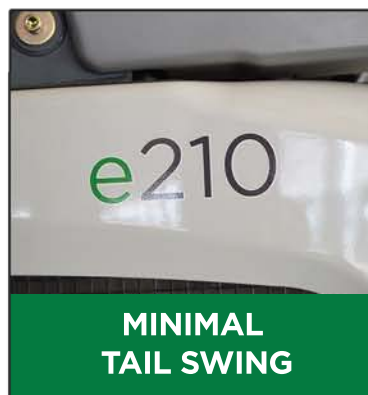
MINIMAL TAIL SWING