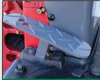
FOLDABLE FOOT PEDALS