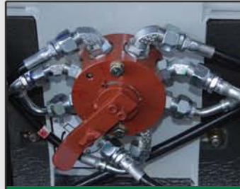
PATTERN CHANGE VALVE