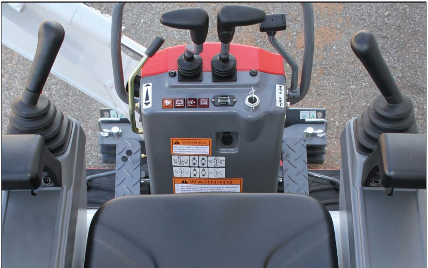
SPACIOUS OPERATOR'S STATION WITH NEW PILOT OPERATED JOYSTICKS

To reduce the likelihood of rear swing impacts, the e210R also features a short tail swing design. Despite its compact dimensions, service access is exceptional thanks to the tilt-up seat pedestal and access panels.