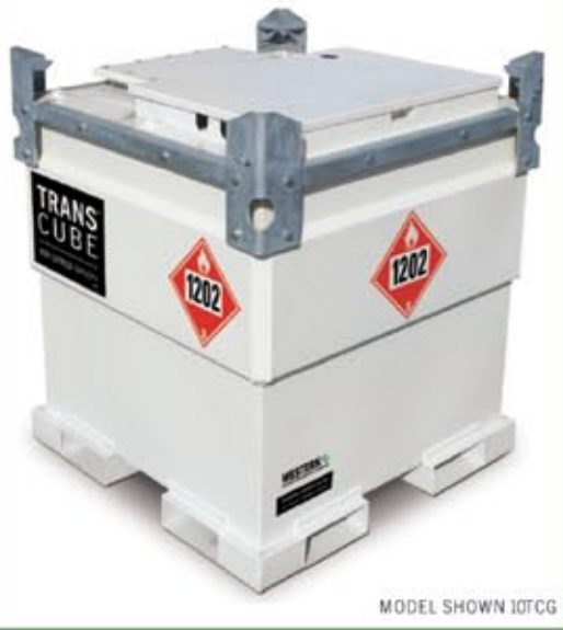
MODEL SHOWN 10TCG

The Transcube 'Global' is fabricated with 11 guage (3mm) mild steel to comply with United Nations 'Standardized Means of Containment' guidelines. Standard fitting includes 3" fusible fill port, contents guage, pressure/vacuum vents, 1" pump feed connection, 1/2" feed and return line connections for generator, and inspection manhole.