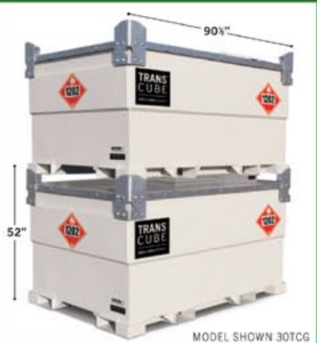
MODEL SHOWN 30TCG

The Transcube 'Global' is approved for stacking 2 high full and 3 high empty, helping to reduce your storage space requirements.