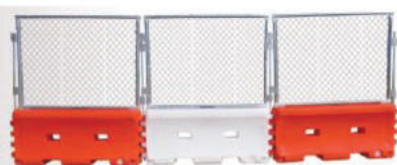
Water-Wall Fence can be easily attached to Water-Wall for additional job-site security.