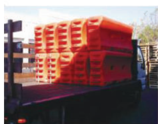
Water-Wall stacks for storage and transportation

Water-Wall to be 72" long x 32" tall x 18" wide and molded from linear low density polyethylene. Water-Wall to be MASH Eligible as a Longitudinal Channelizing Device, TL-2. Individual wall shall weigh 80 lbs. empty and 1,110 lbs. filled. Standard colors are white or orange. Water-Wall sections are connected together with galvanized steel T-pins passing through a double wall knuckle which minimizes breakage at hinge points. Wall shall pivot up to 30 degrees when connected. Water-Wall to have one 8" diameter fill hole for quick fill and a twist lock cap for closure. Water-Wall will have molded through holes to provide easy movement. Drain plug to be offset to protect against cracking or breaking and have coarse buttress threads for quick removal and attachment. Water-Walls shall stack for easy movement and storage.