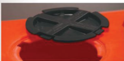
Large 8" fill hole speeds filling process, includes twist-lock plastic cap