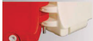
Water-Wall can pivot 30-degrees and be locked together with steel connection pins