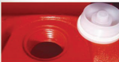
New tamper resistant, offset drain plug with coarse buttress thread