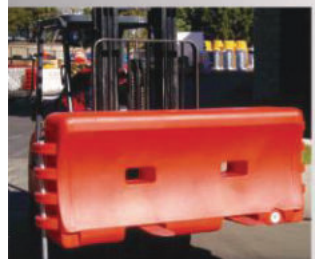
Water-Wall can be easily lifted and placed using a forklift or pallet jack