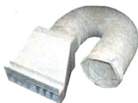
THCP-DD and THCP-WD12