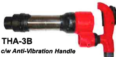
THA-3B c/w Anti-Vibration Handle

The THH-9J matches the maximum allowed on the new Ministry Specification (Ontario) for partial removal bridge deck work, for the most power possible.