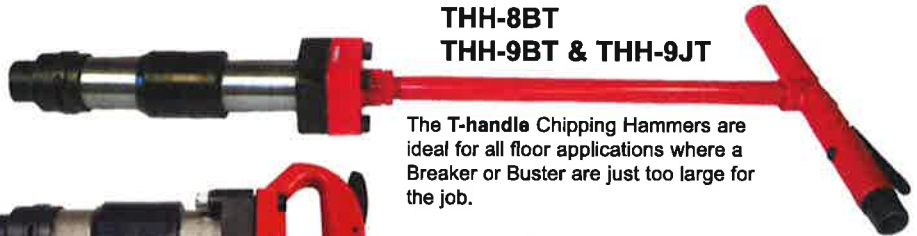
THH-8BT THH-9BT & THH-9JT

The T-handle Chipping Hammers are ideal for all floor applications where a Breaker or Buster are just too large for the job.