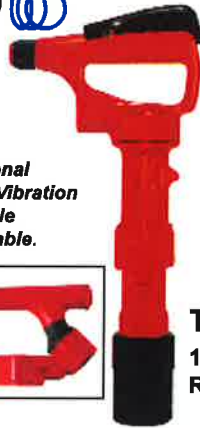
THD-1100N 14lb Class Rock Drill