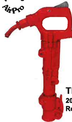
TD-20 20lb Class Rock Drill