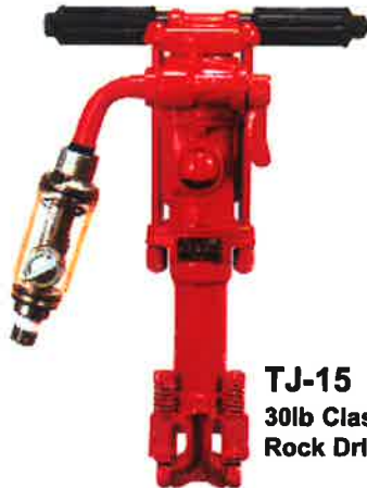
TJ-15 30lb Class Rock Drill