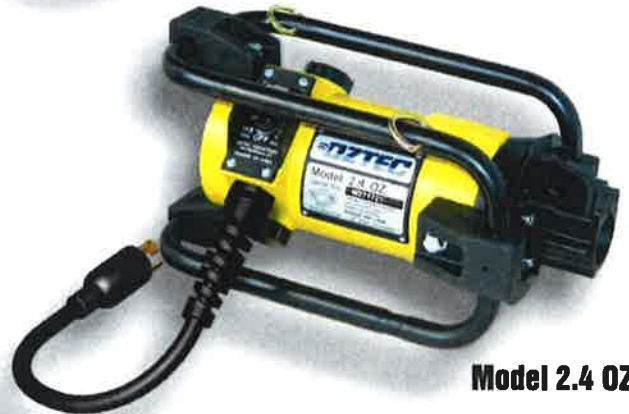
Model 2.4 OZ