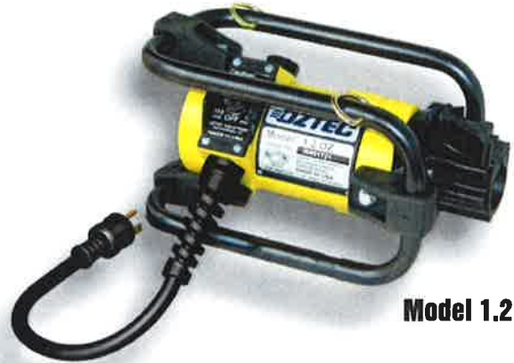
Model 1.2 OZ

Rugged, and Durable! Oztec's design has been extensively tested and used on-the-job for over thirty years. The wrap around protective frame and shock absorbers effectively protect Oztec motors from damage even when dropped or thrown from heights of over six feet.