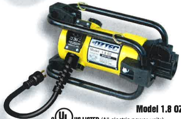
Model 1.8 OZ