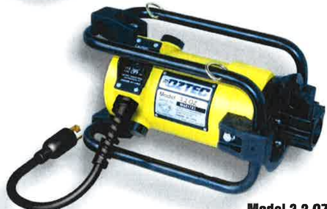
Model 3.2 OZ