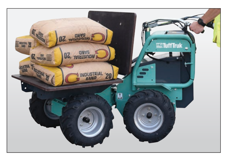
TuffTruk Flatbed — TFB33 and TFB29 — 33.4 or 29.0 inch width, ideal for transporting heavy bags of material.