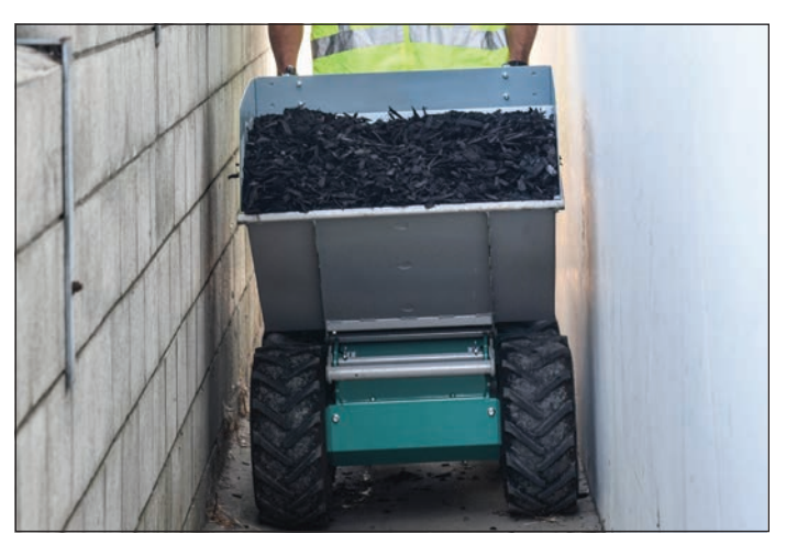
Optional 7 ft³ clip-on tub — TT7 — allows access through narrow 32-inch passageways.