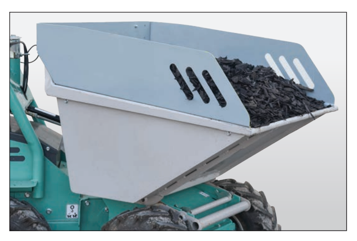
TuffTruk Extension Kit — TTE — 33.4 or 29.0 inch width, ideal for increased capacity when carrying light loads. (Steel tub only)