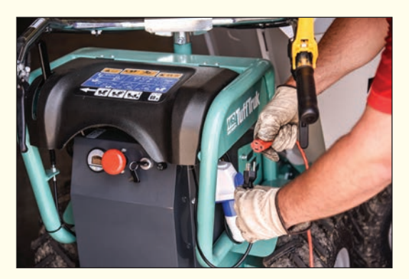
Integral battery charger uses standard 120 Volt power and features overcharge protection.