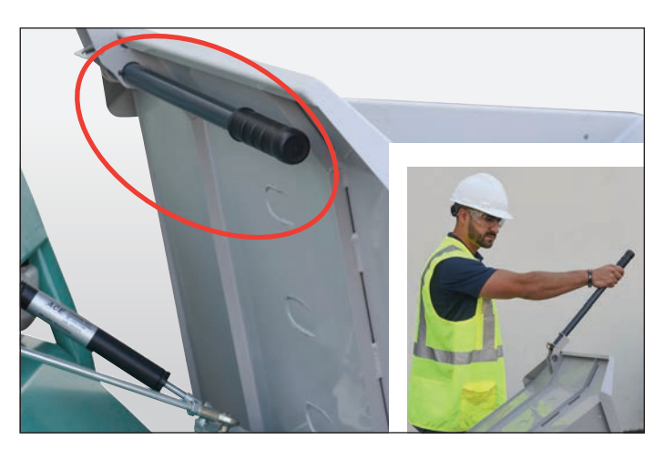
TuffTruk Dump Handle — TTH — for added convenience when discharging tub uphill.