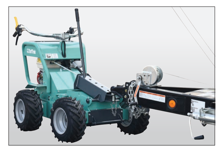
TuffTruk 2-Inch Towing Hitch — TBH — offers various height positions for different size trailers.