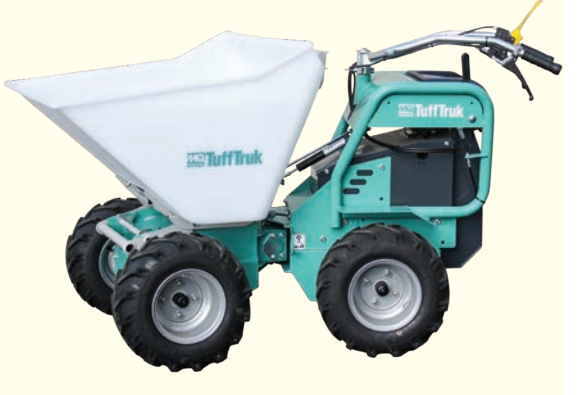
Available with a Polyethylene Tub