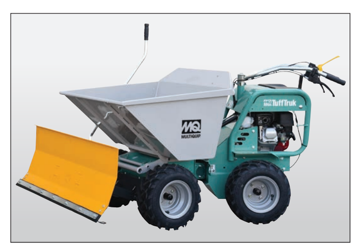
TuffTruk Snow Plow — TSP — perfect for displacing snow during poor weather conditions.