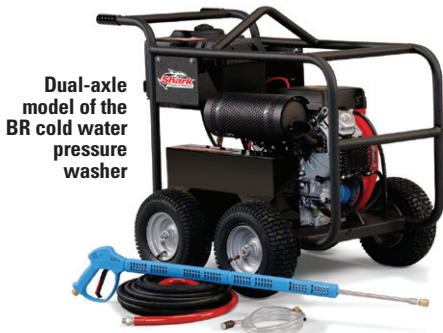
Dual-axle model of the BR cold water pressure washer

The Shark BR series is the most rugged cold water pressure washer on the market with two models that deliver cleaning power of up to 5000 PSI. Also in the line are four dual-axle models, including three models with electric start.