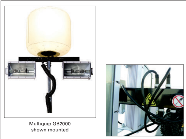
Multiquip GB2000 shown mounted

The LT6-Series offers a simple and easy method of lamp connections through 3-pin quick disconnect couplers. This design permits expedient troubleshooting of lamps as well as fast set-up for optional GloBug diffused lighting systems that require connection to the electrical ballasts.