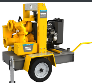
TRAILER PAS 100HF