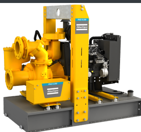
BLOCK PAS 100HF