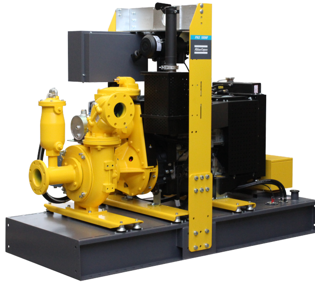
PAS 100HF 250 Liquid cooled engine

Diesel - Qmax 280 m 3 /h (1,230 USgpm) - Hmax 50 m (164 ft)