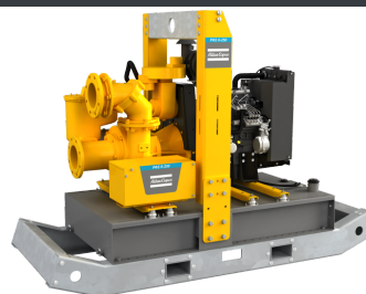
SKID02 PAS 100HF