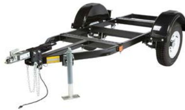
K2636-1 Medium Welder Trailer (shown with K2639-1 Fender & Light Kit)