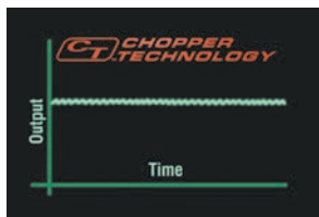
Chopper Technology® delivers extremely fast response for tighter output control.

Patented and award-winning Lincoln Electric Chopper Technology® delivers superior DC arc welding performance for general purpose stick, downhill pipe, DC TIG, MIG, cored-wire and arc gouging.