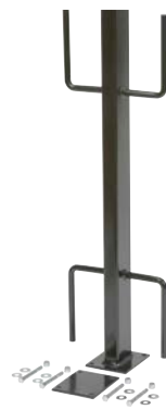
K2640-1 Cable Rack