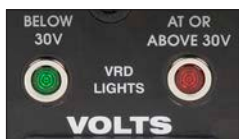
VRD™ portion of nameplate with green light on.