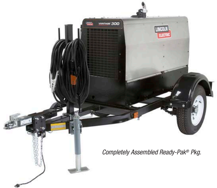
Completely Assembled Ready-Pak® Pkg.