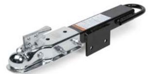
Duo-Hitch® 2 in. (51 mm) Ball/Lunette Eye Hitch (included)