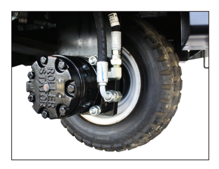
The All-Wheel Drive buggy is equipped with a powerful steering drive motor for optimum performance. A single over-sized tire provides superior traction.