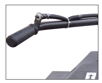
Pressing button in AWD mode prevents wheel slippage and improves traction.