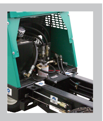
Quick Service Access

Hinged access door for easy maintenance.