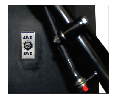
Toggle switch allows operator to easily switch from two-wheel drive to all-wheel drive.

Easily switch to All Wheel Drive and maintain high levels of production in the most challenging environments whether it's sand, mud, or loose gravel. Heavy duty main frame provides structural integrity with low center of gravity for increased stability and traction.