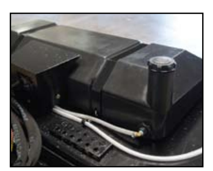
Low Profile Water Tank