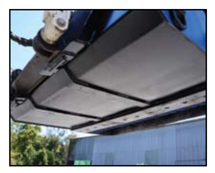
Wear Strip and Bolt-On Edge