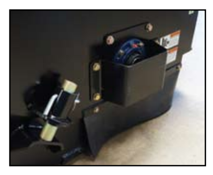
Adjustment Pin and Bearing Guard