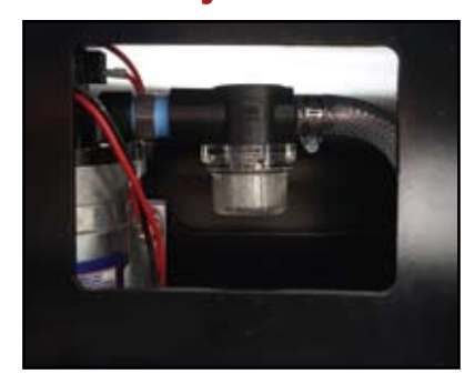
Water System Pump and Filter