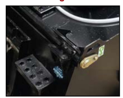
Step, Grease Fitting and Dump Stops