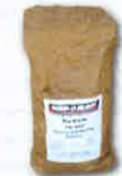
DESICCANT (50 lb. / bag) Stock # 79000