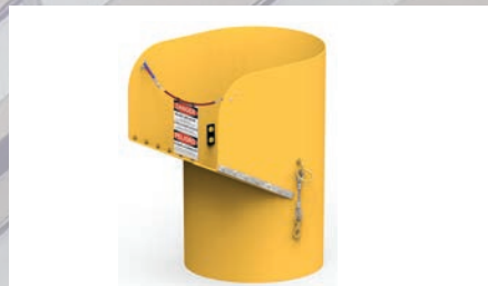
Top Hopper Section