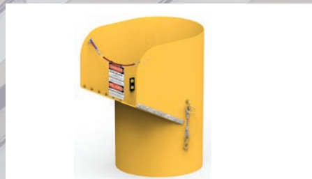
Top Hopper Section