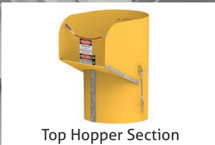
Top Hopper Section