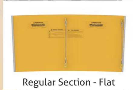
Regular Section - Flat