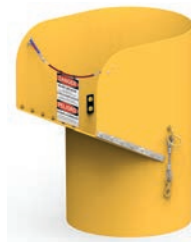
Top Hopper Section