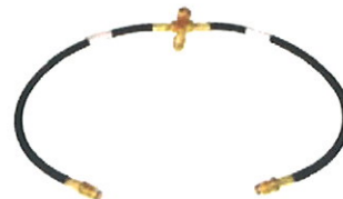
2001-S3 3 cylinder manifold