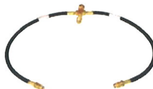
2001-S3 3 cylinder manifold